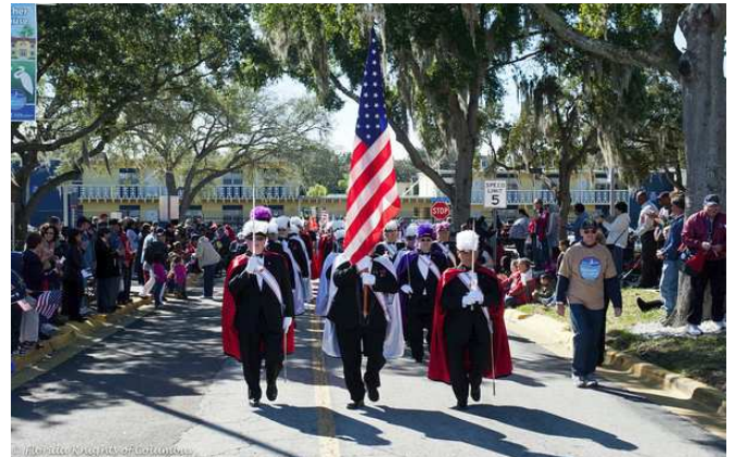
VETERANS DAY PARADE, KofC COLOR GUARD, TAMPA, FL, HALEY HOSPITAL