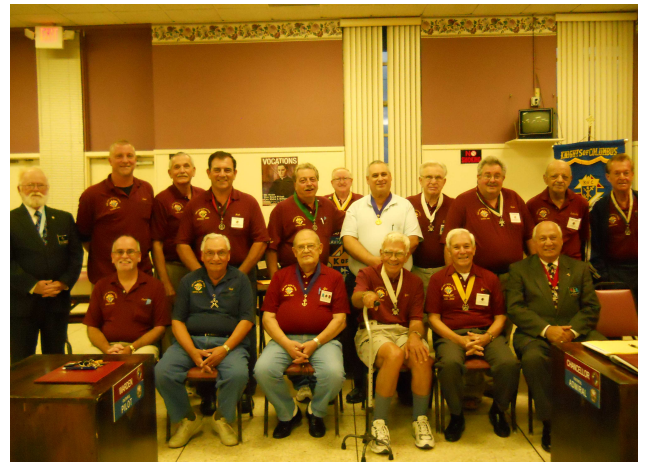
2013-2014 Officers KofC Council 11680