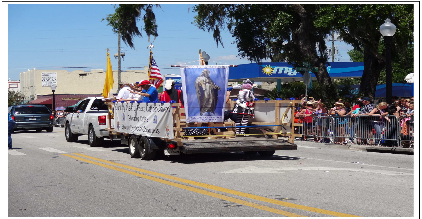
KofC Council 11680 and Fr. Powers Assembly 2882 Centennial Float in Chasco Fiesta Parade